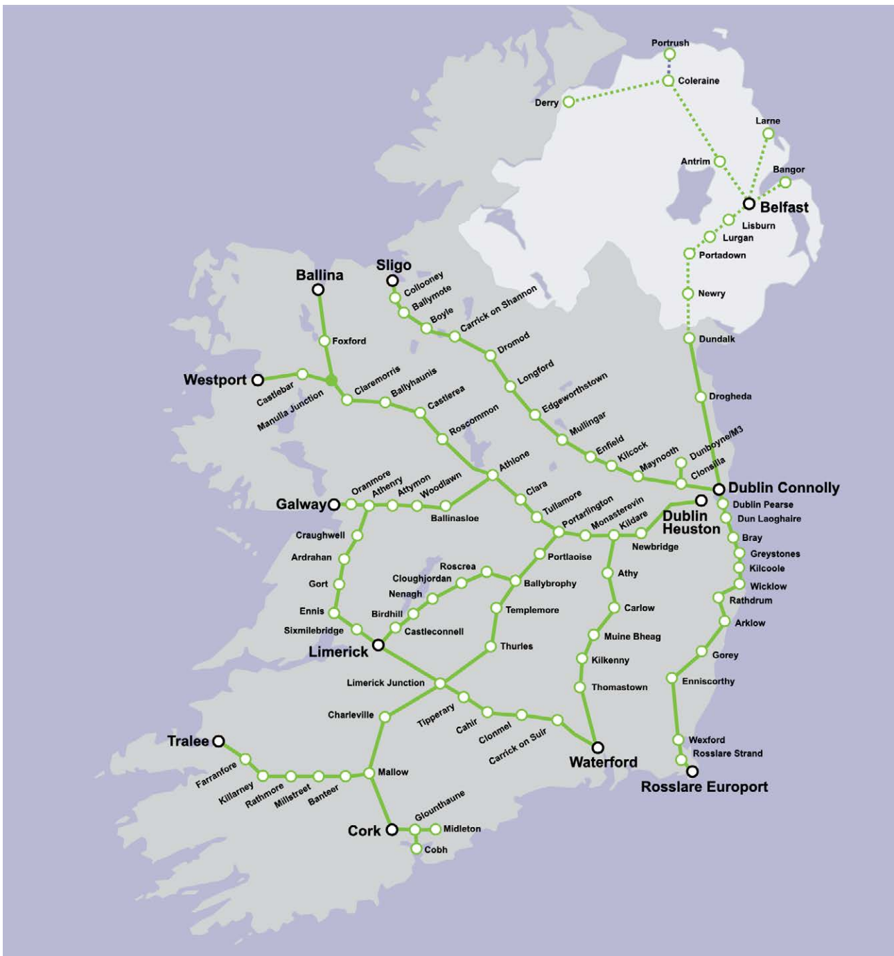
Figure 1: Infrastructure deficits in the north-west (rail network).