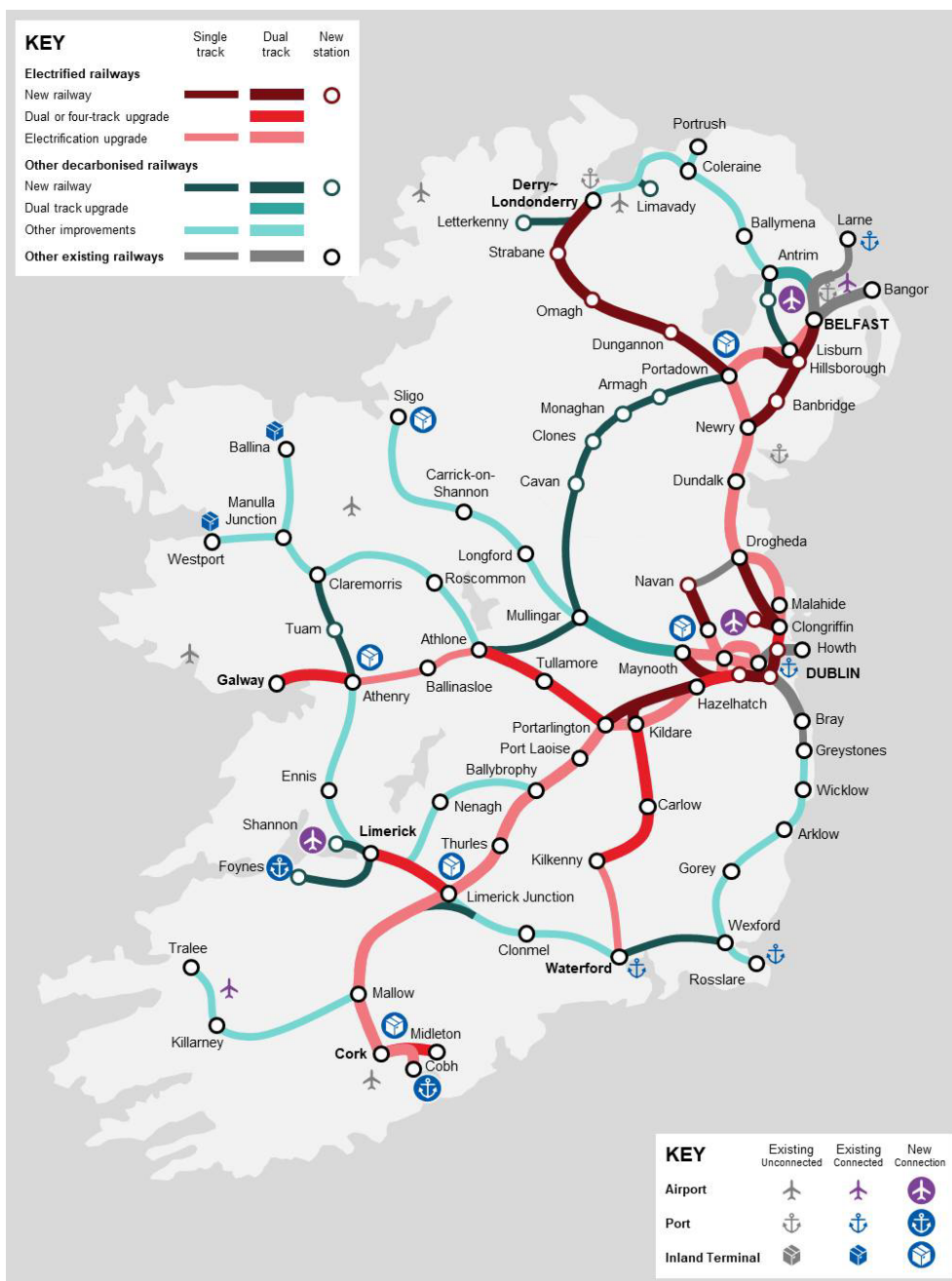
Figure 2: A potential future all-island rail network.