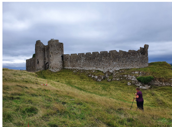
Geophysical survey being carried out at Castle Roche.jpg

8. Please outline the objectives of the: Castleroches, Co. Louth, is a masonry-walled enclosure castle dramatically sited on a rocky