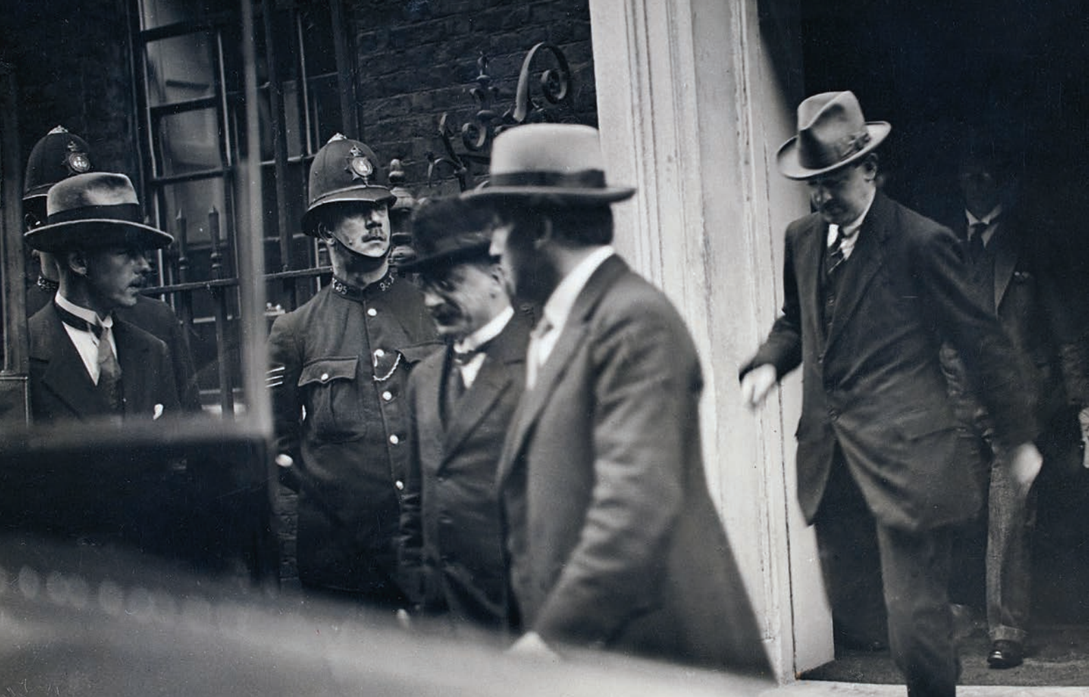
Arthur Griffith and Michael Collins emerge from 10 Downing St during the Treaty negotiations, with Emmet Dalton on the far left. Dalton had served in the British Army during the First World War and later joined the IRA. He made some of the arrangements for the Irish delegation in London, including purchasing an aircraft to fly Collins and others back to Ireland should the talks collapse.

commitment against him to ensure that the Irish plenipotentiaries could not break off the negotiations on those grounds.